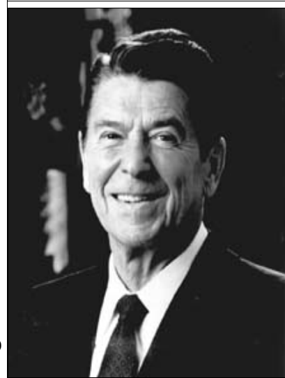
Ronald Reagan Library